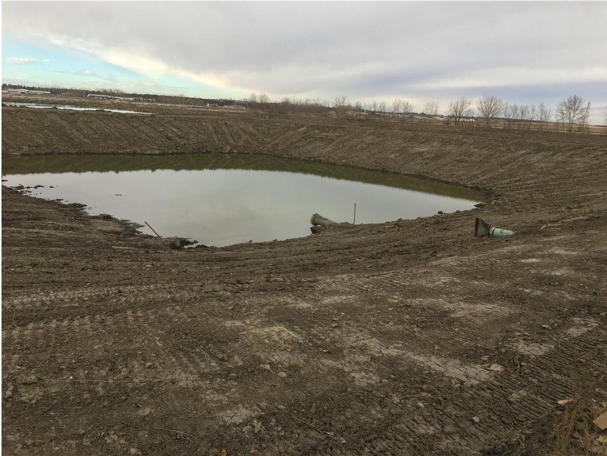
Figure 4: Lacombe Equalization Lagoon Berm Construction