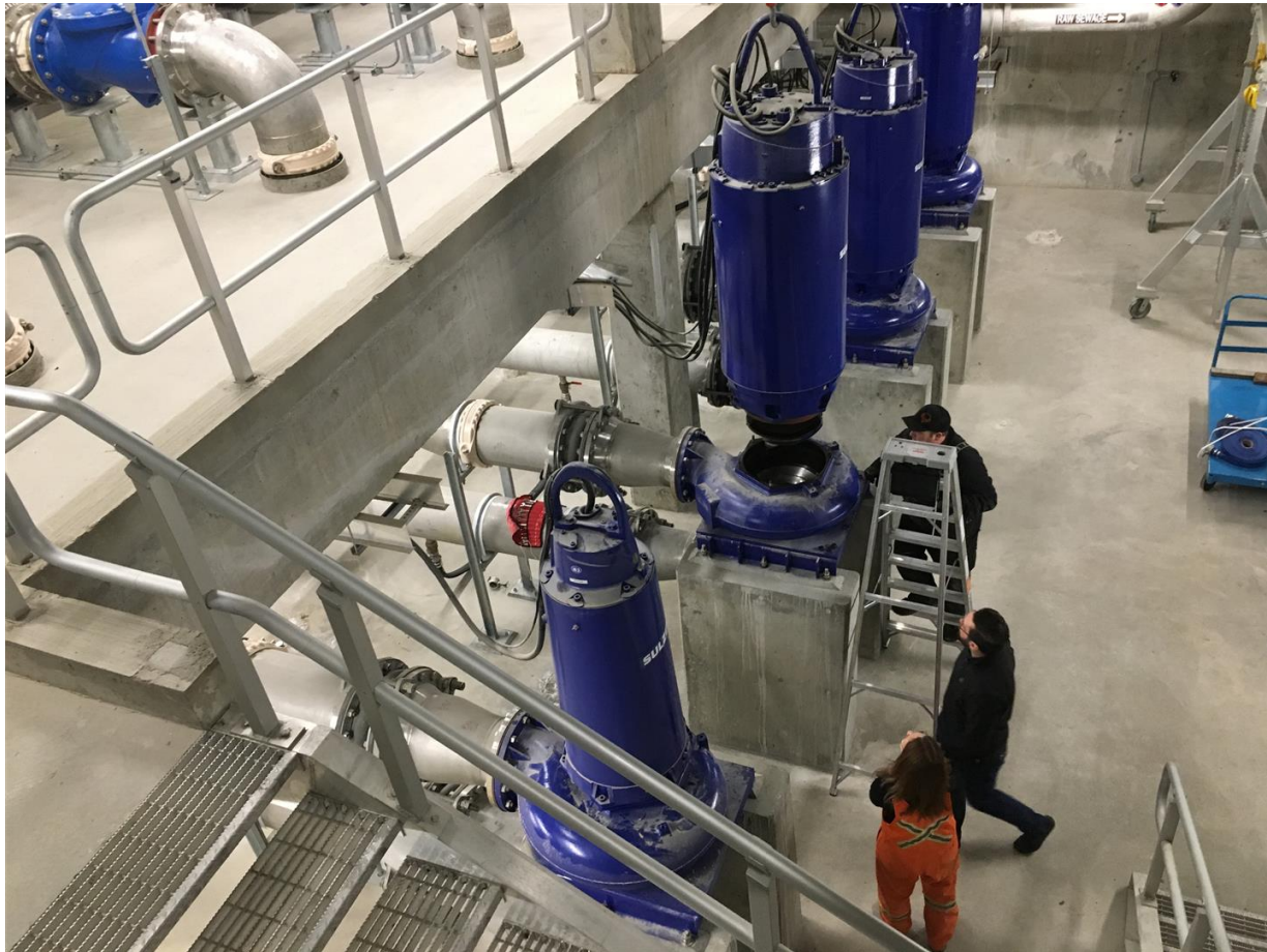
Figure 2: Lacombe Regional Lift Station Pump Removal