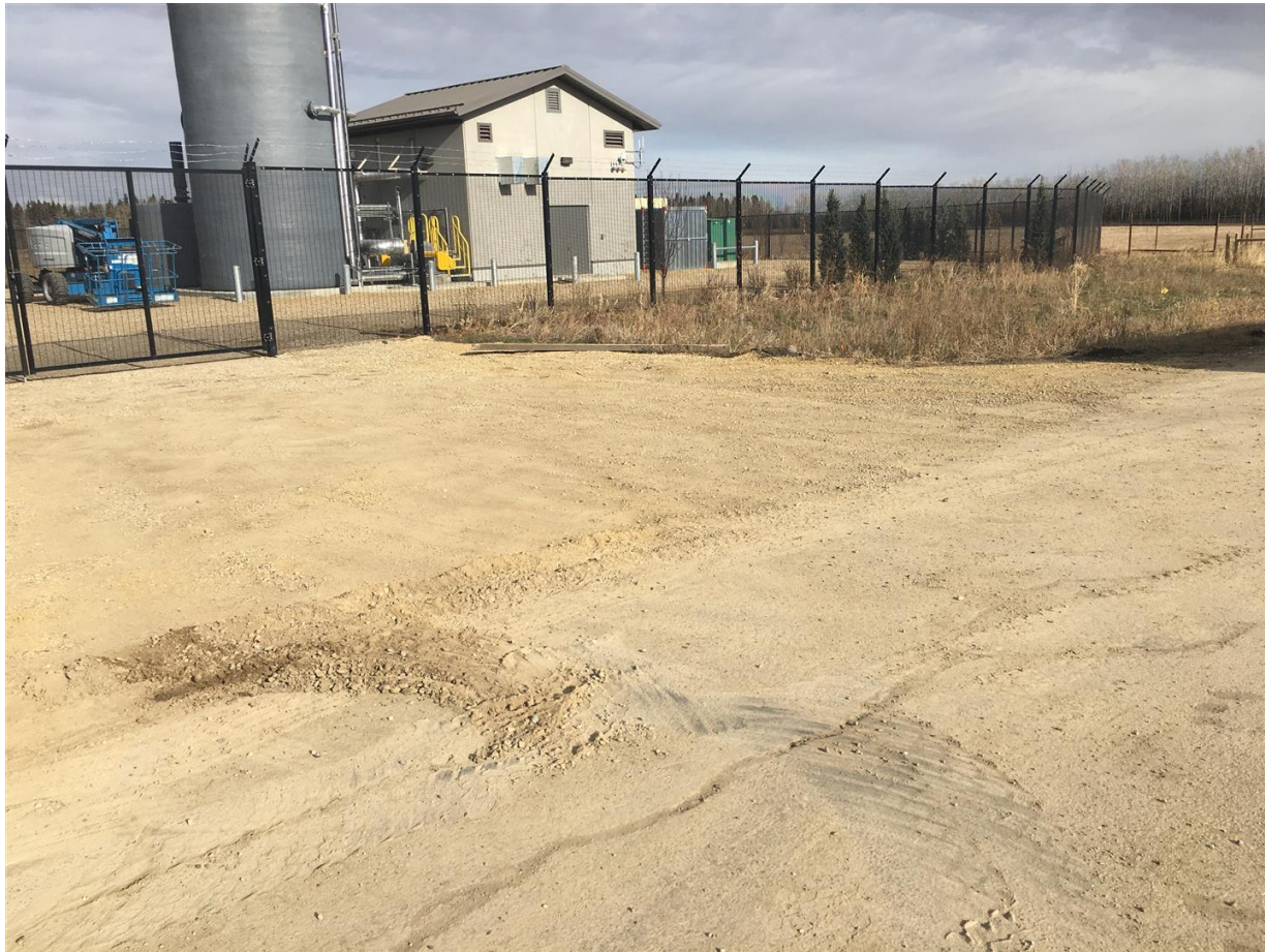
Figure 1: The Odour Management Facility