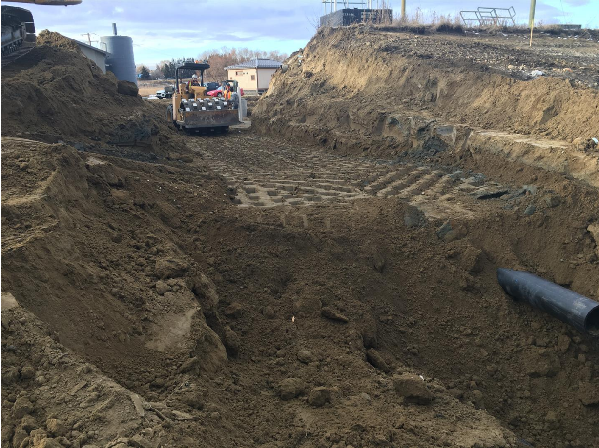
Figure 3: Blackfalds Equalization Lagoon Pipe Install